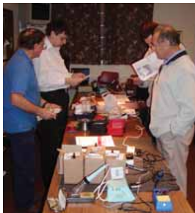
Braintree club members check they have all the components for their kits