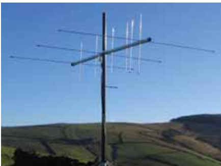
SOTA Beams new dual-band portable antenna

SOTA beams has announced the SB270, a super light-weight beam for 2m and 70cm portable use. They say the new design makes the SB270 "the easiest-to-use portable aerial ever". In addition to adding 70cm, a new element mounting technique has been developed making it faster than ever to put this aerial together in extreme conditions. The 3-ele 2m beam gives "even better performance than the original SOTAbeam", and the 6-ele 70cm Yagi has "a very clean radiation pattern as well as a broad bandwidth allowing its use for satellite and ATV". The whole beam packs into a single slim tube, 1m long. The SB270 is sold as a complete kit including feeder, a mast and guying kit and is available at an introductory price of £79.95 + £8.50 p&p. Users of the original SOTAbeam will benefit from a trade-in deal. Details at http://www.sotabeams.co.uk .